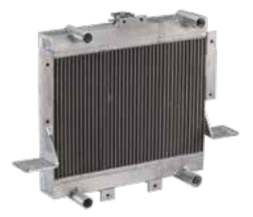
Turn-key Cooling Module

Agriculture Construction Forestry Material Handling Mining Off-Highway On-Highway Specialty Turf Care